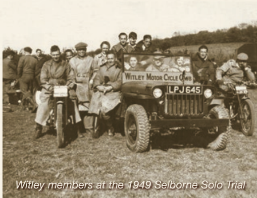
Witley members at the 1949 Selborne Solo Trial

Witley MCC is a forward-looking Club and our aim is to promote all aspects of motorcycle sport and leisure in the 21st century, building on our long heritage of over 100 years of excellence in organisation and competition.